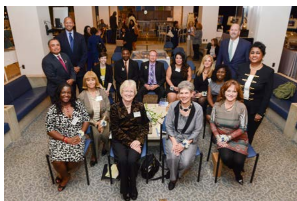
Henry Ford's 2016 Diversity Heroes with System leadership at the award program and celebration.