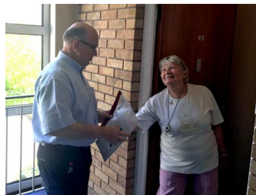
A letter carrier in Jersey, United Kingdom, visits an elderly resident on his route as part of the innovative "Call-and-Check" program, a model for a developing Henry Ford pilot program.

The pilot is part of ongoing work by Henry Ford's Global Health Initiative (GHI) and Institute for Health Improvement (IHI) to investigate programs and processes from outside the country that will benefit people in the U.S., known as reverse innovation.