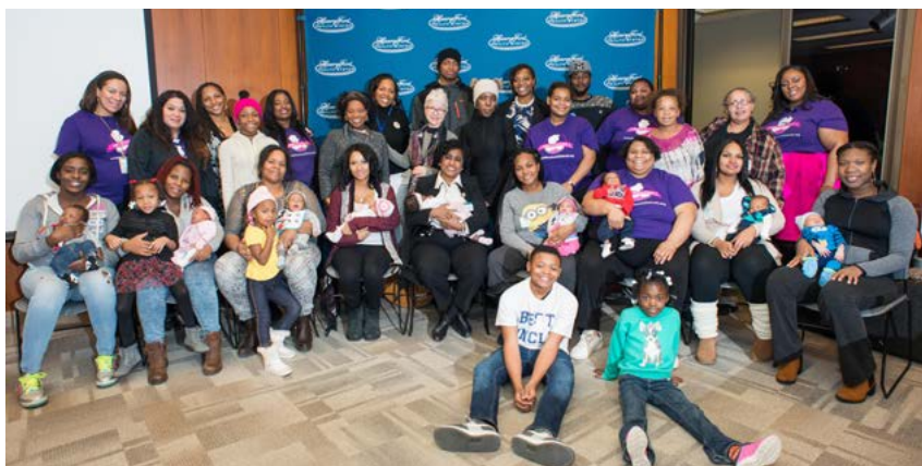
WIN Network: Detroit Group Prenatal Care program participants and leaders gather with their children at a reunion celebration.

Groups are organized around due dates, and each of the 10 group visits is two hours long. Mothers measure their own weight and blood pressure while midwives measure fundal height and fetal heartbeats before the session starts. Any medical concerns or personal questions are addressed privately, appropriately and immediately. The majority of the meetings center around education on a topic of the day, discussion, and sharing. Attendance is robust, due in large part to the personal connection between the CHW and the mothers-to-be.